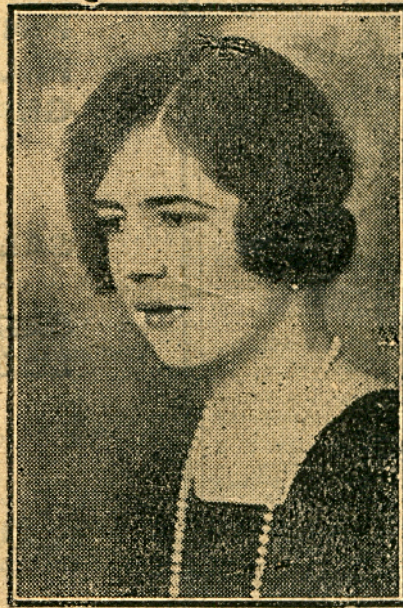
THE BRIDE AND BRIDEGROOM.