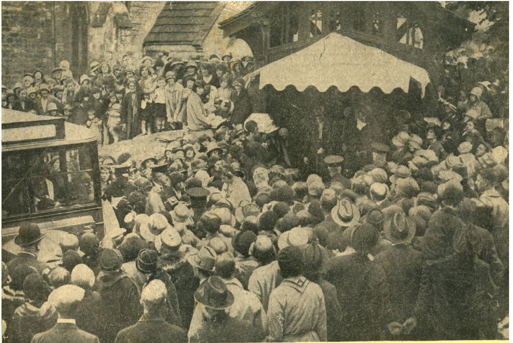
THE BRIDESMAIDS at yesterday's wedding, leaving the church surrounded by a